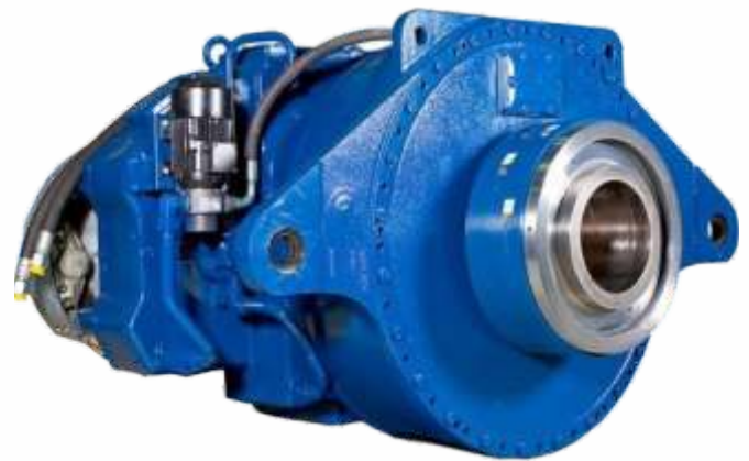
KR 302 SPL